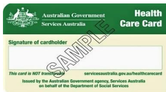
Health Care Card