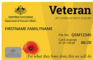
DVA (Department of Veteran Affairs)